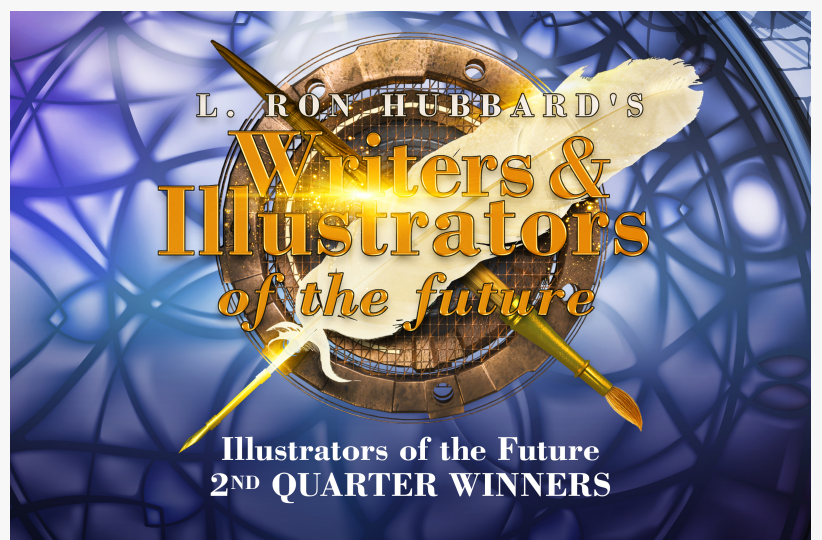
Winners announced for 2nd quarter Illustrators of the Future

The intensive mentoring process has proven very successful. The 428 past winners of the Writing Contest have published 1,150 novels and nearly 4,500 short stories. They have produced 33 New York Times bestsellers and their works have sold over 60 million copies.