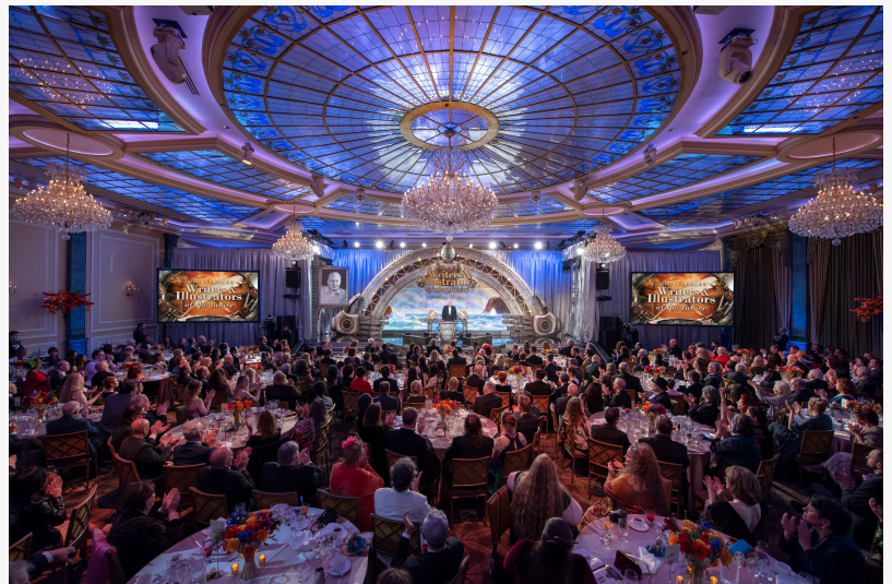
Writers of the Future Event 2019